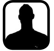
MAX TSHOUKAS Defender