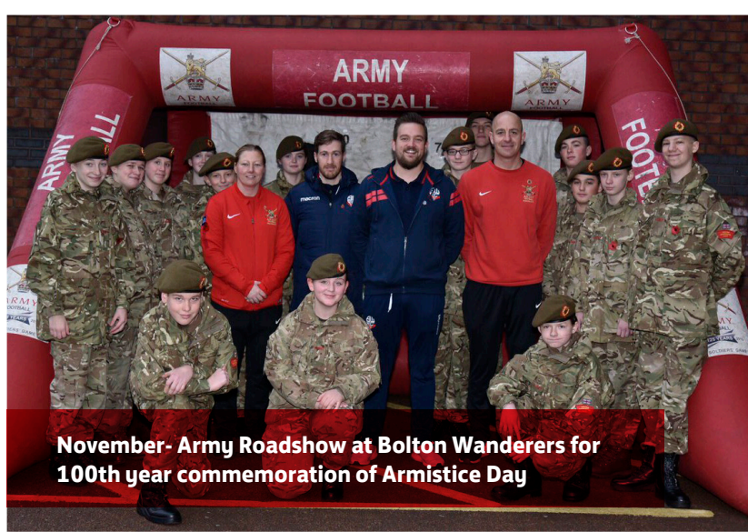
November- Army Roadshow at Bolton Wanderers for 100th year commemoration of Armistice Day