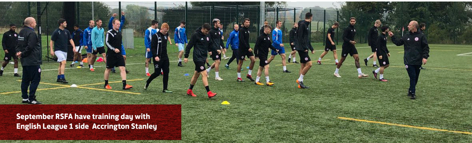
September RSFA have training day with English League 1 side Accrington Stanley