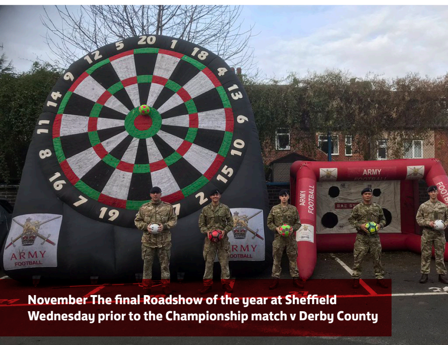
November The final Roadshow of the year at Sheffield Wednesday prior to the Championship match v Derby County