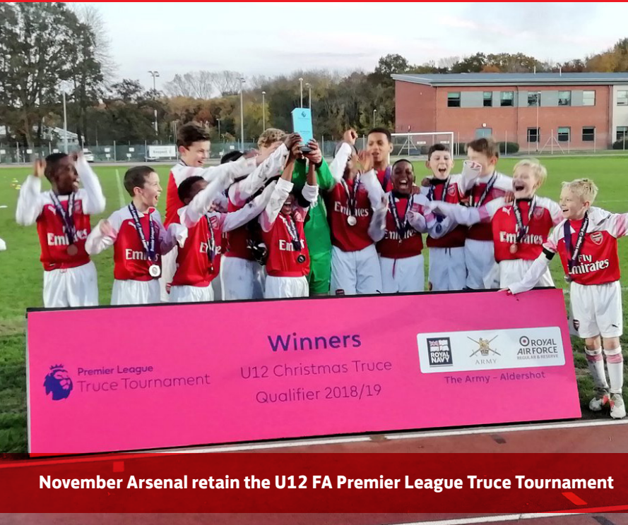
November Arsenal retain the U12 FA Premier League Truce Tournament