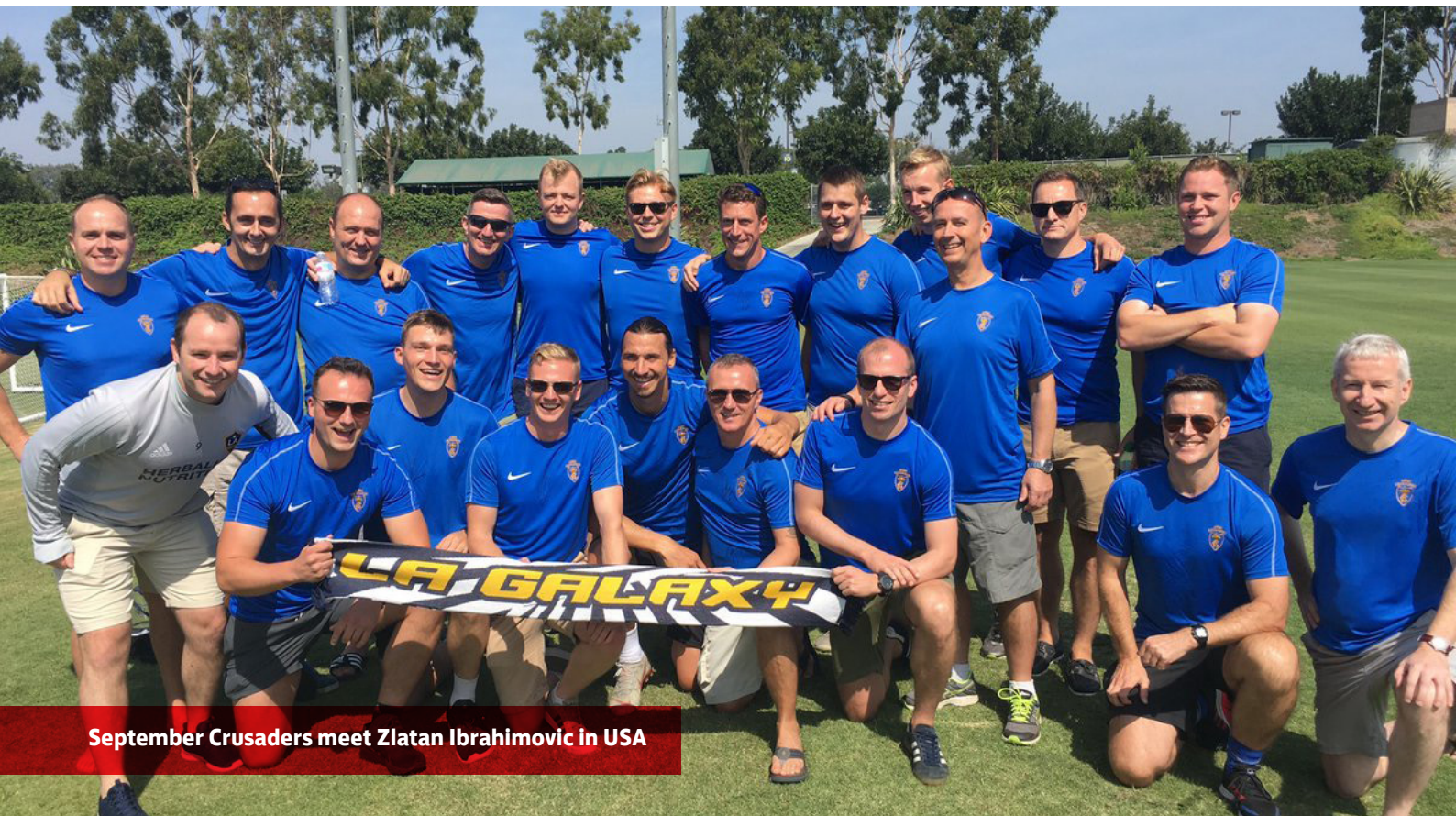
September Crusaders meet Zlatan Ibrahimovic in USA