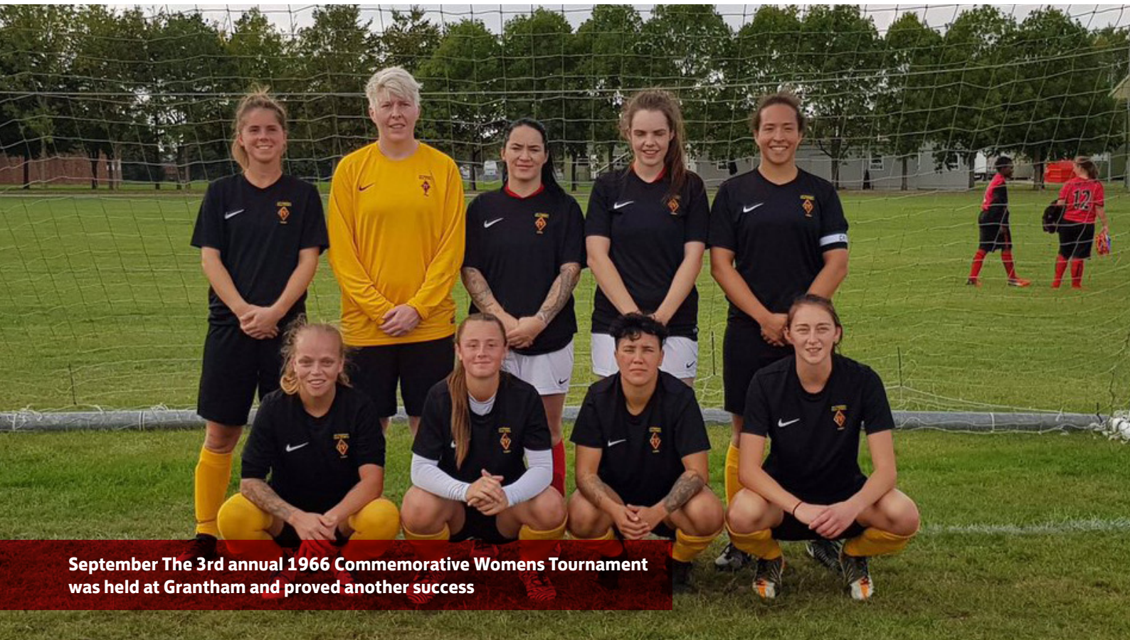
September The 3rd annual 1966 Commemorative Womens Tournament was held at Grantham and proved another success