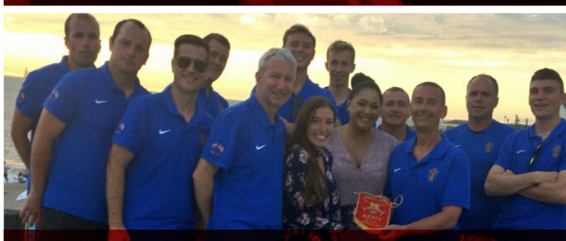
Army Crusaders Presentation to the US Wounded Warrior Project. Redondo Beach LA