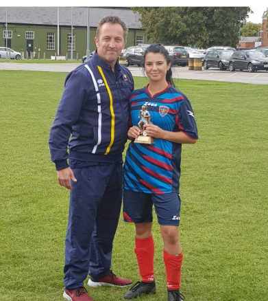
September In the largest grassroots tournament in Army Womens unit football approaching 100 matches were played