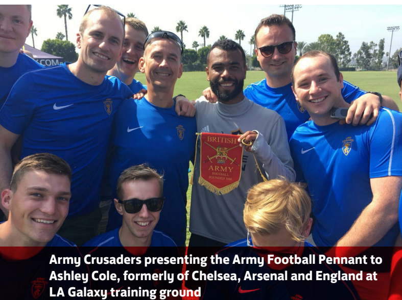
Army Crusaders presenting the Army Football Pennant to Ashley Cole, formerly of Chelsea, Arsenal and England at LA Galaxy training ground

Overall P3 W2 L1 with 1 game cancelled at short notice