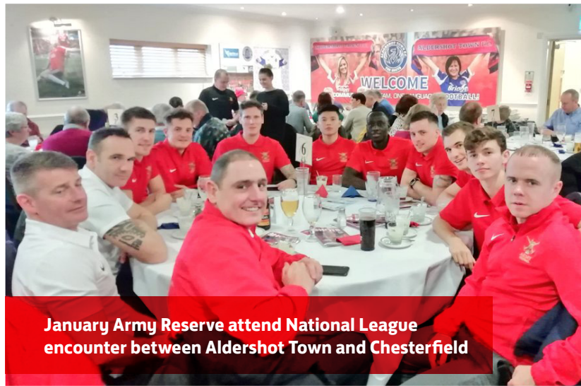
January Army Reserve attend National League encounter between Aldershot Town and Chesterfield