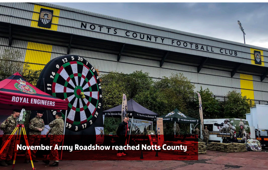
November Army Roadshow reached Notts County