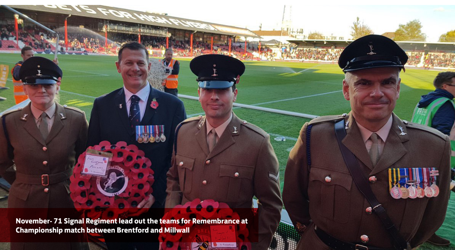
November- 71 Signal Regiment lead out the teams for Remembrance at Championship match between Brentford and Millwall