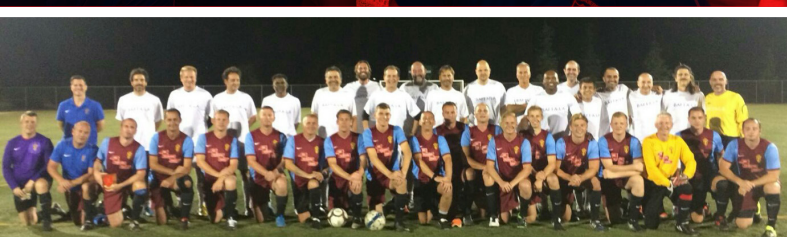
Army Crusaders v BAFTA XI. Sherman Oaks LA