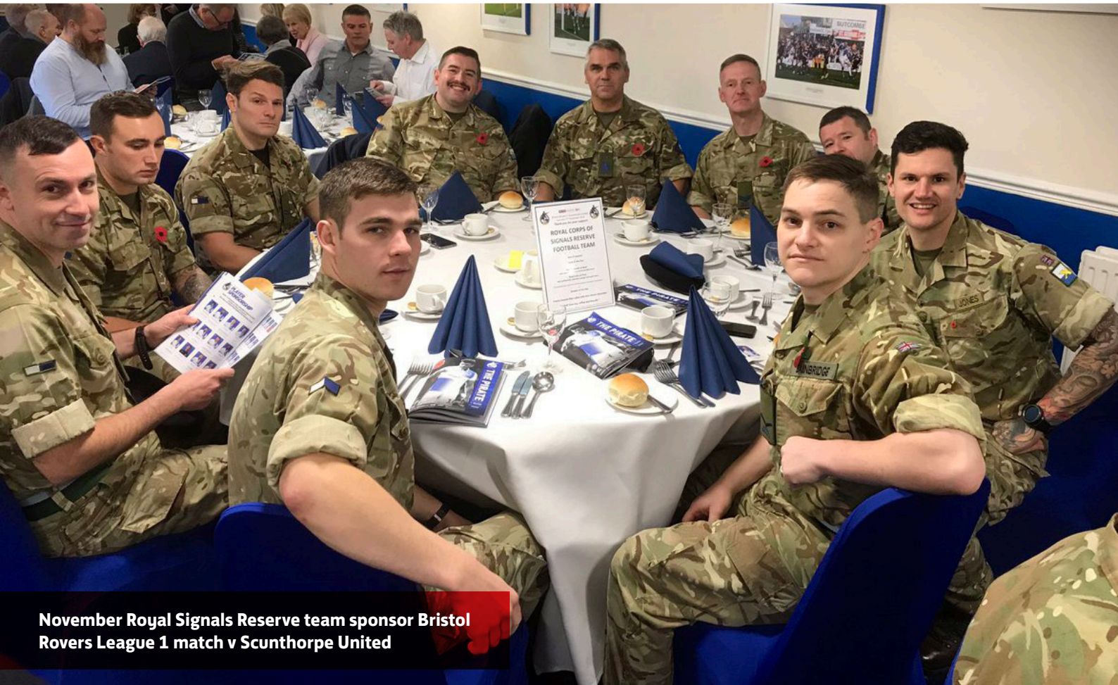
November Royal Signals Reserve team sponsor Bristol Rovers League 1 match v Scunthorpe United