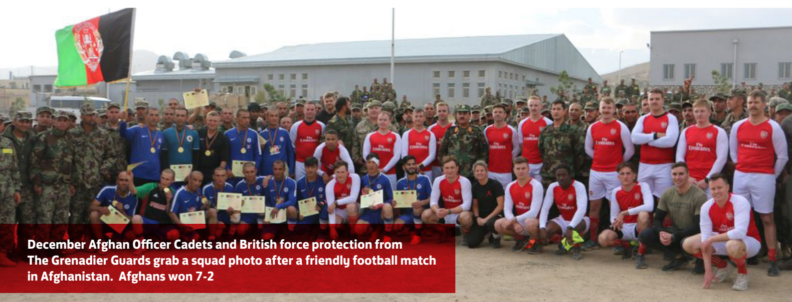
December Afghan Officer Cadets and British force protection from The Grenadier Guards grab a squad photo after a friendly football match in Afghanistan. Afghans won 7-2