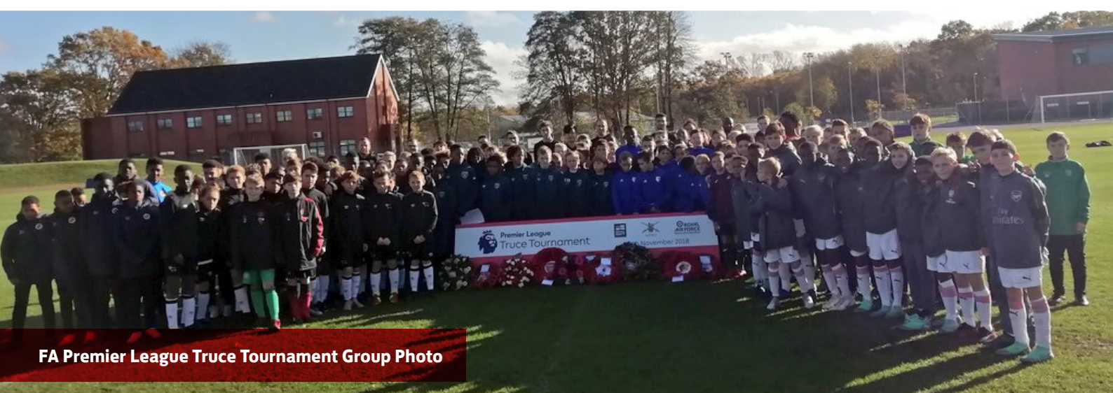
FA Premier League Truce Tournament Group Photo