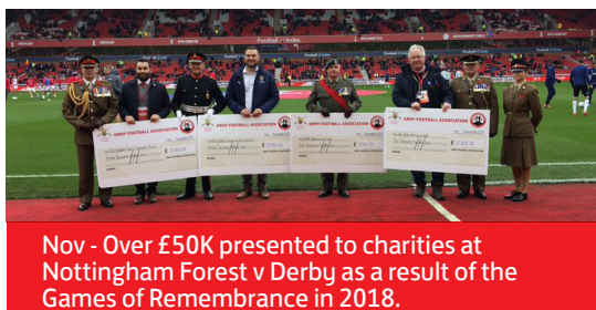
Nov - Over £50K presented to charities at Nottingham Forest v Derby as a result of the Games of Remembrance in 2018.