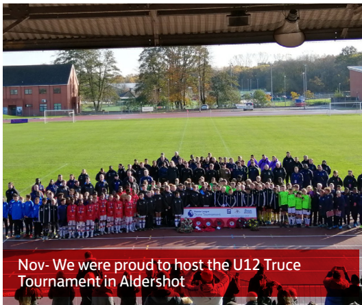
Nov- We were proud to host the U12 Truce Tournament in Aldershot