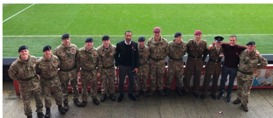
Nov- Remembrance Service at Aldershot Town FC