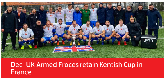
Dec- UK Armed Forces retain Kentish Cup in France