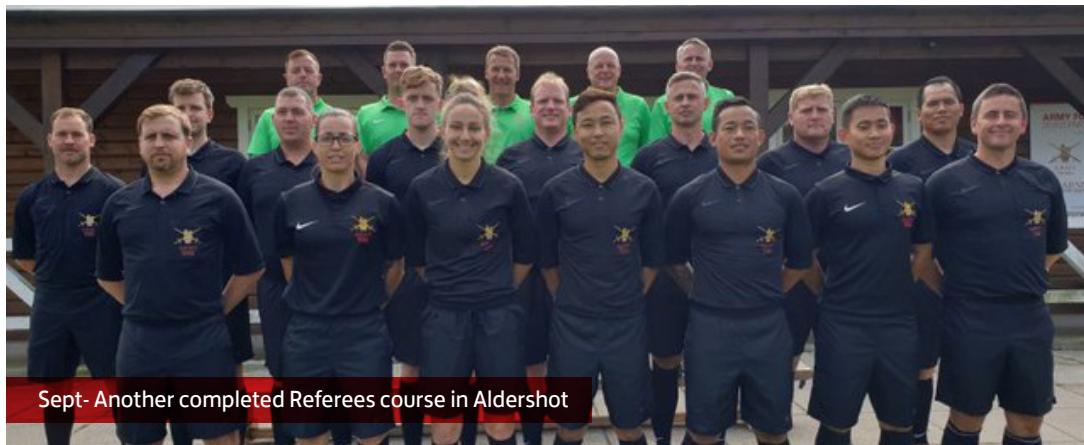
Sept- Another completed Referees course in Aldershot