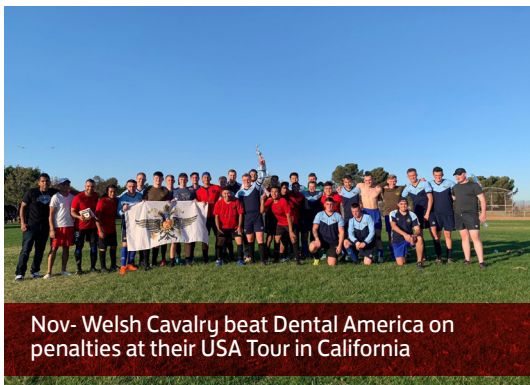
Nov- Welsh Cavalry beat Dental America on penalties at their USA Tour in California