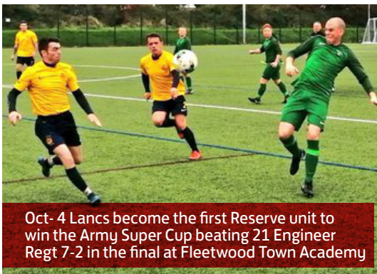
Oct- 4 Lancs become the first Reserve unit to win the Army Super Cup beating 21 Engineer Regt 7-2 in the final at Fleetwood Town Academy