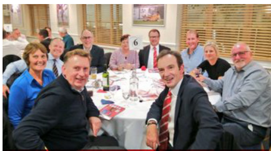
Sept - The Army FA sponsoring the match ball at the Aldershot Town v Yeovil Town National League match