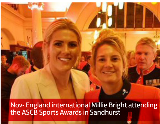
Nov- England international Millie Bright attending the ASCB Sports Awards in Sandhurst