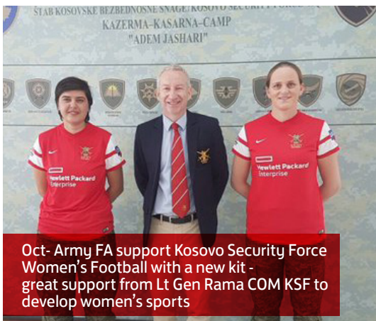
Oct- Army FA support Kosovo Security Force Women's Football with a new kit - great support from Lt Gen Rama COM KSF to develop women's sports