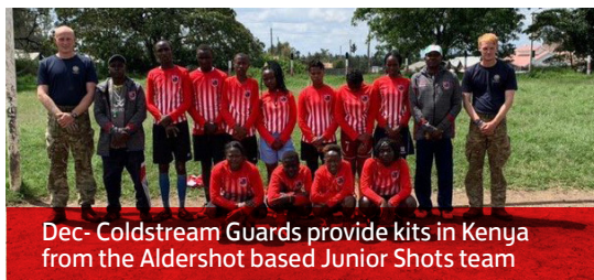
Dec- Coldstream Guards provide kits in Kenya from the Aldershot based Junior Shots team