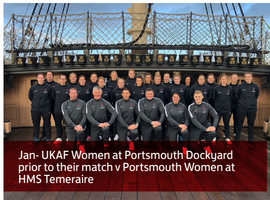
Jan- UKAF Women at Portsmouth Dockyard prior to their match v Portsmouth Women at HMS Temeraire