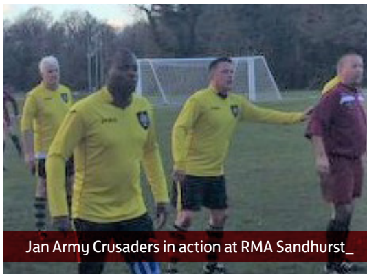
Jan Army Crusaders in action at RMA Sandhurst