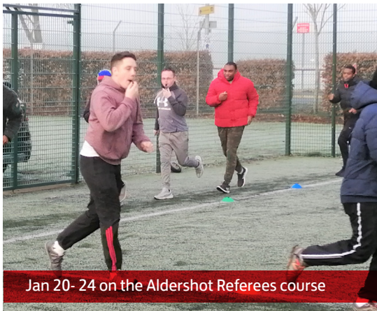
Jan 20- 24 on the Aldershot Referees course