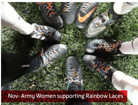
Nov- Army Women supporting Rainbow Laces