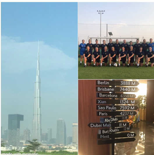
Oct- AGC Womens Team in Dubai