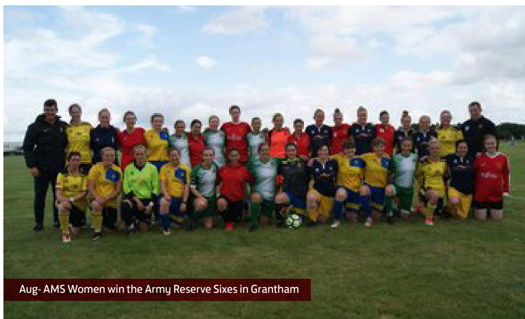
Aug- AMS Women win the Army Reserve Sixes in Grantham