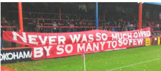
Nov- Remembrance Service at Aldershot Town FC