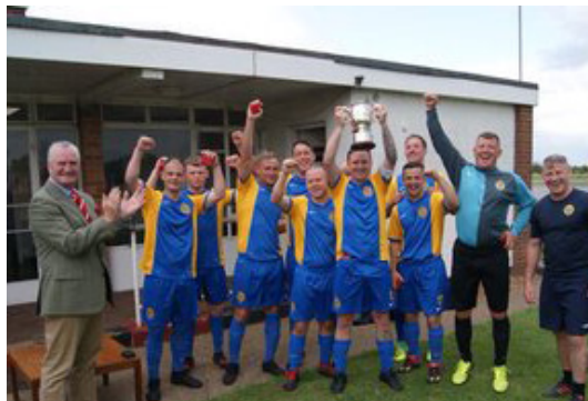
Aug- 152 (NI) Tpt win the Army Reserve Men Sixes