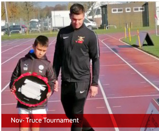
Nov- Truce Tournament