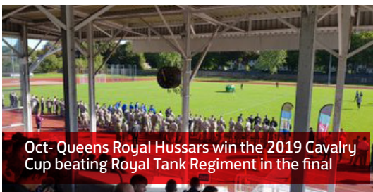
Oct- Queens Royal Hussars win the 2019 Cavalry Cup beating Royal Tank Regiment in the final