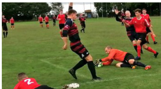
Sept- Infantry beat RE 1-0 in the final of the Reserve Corp Jones Cup in Grantham