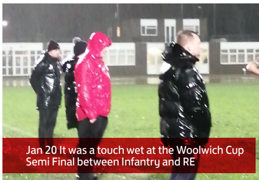
Jan 20 It was a touch wet at the Woolwich Cup Semi Final between Infantry and RE