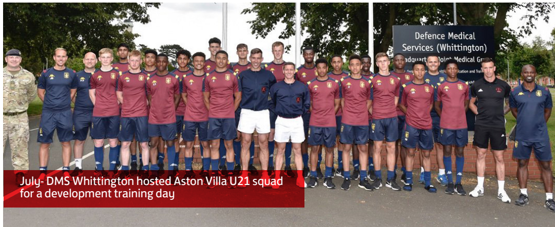
July- DMS Whittington hosted Aston Villa U21 squad for a development training day