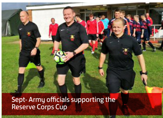
Sept- Army officials supporting the Reserve Corps Cup