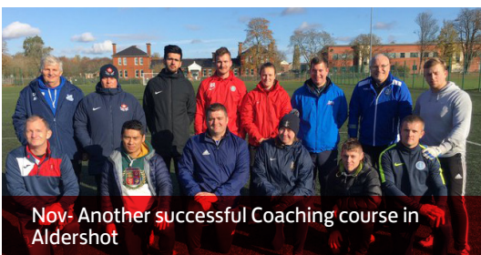
Nov- Another successful Coaching course in Aldershot