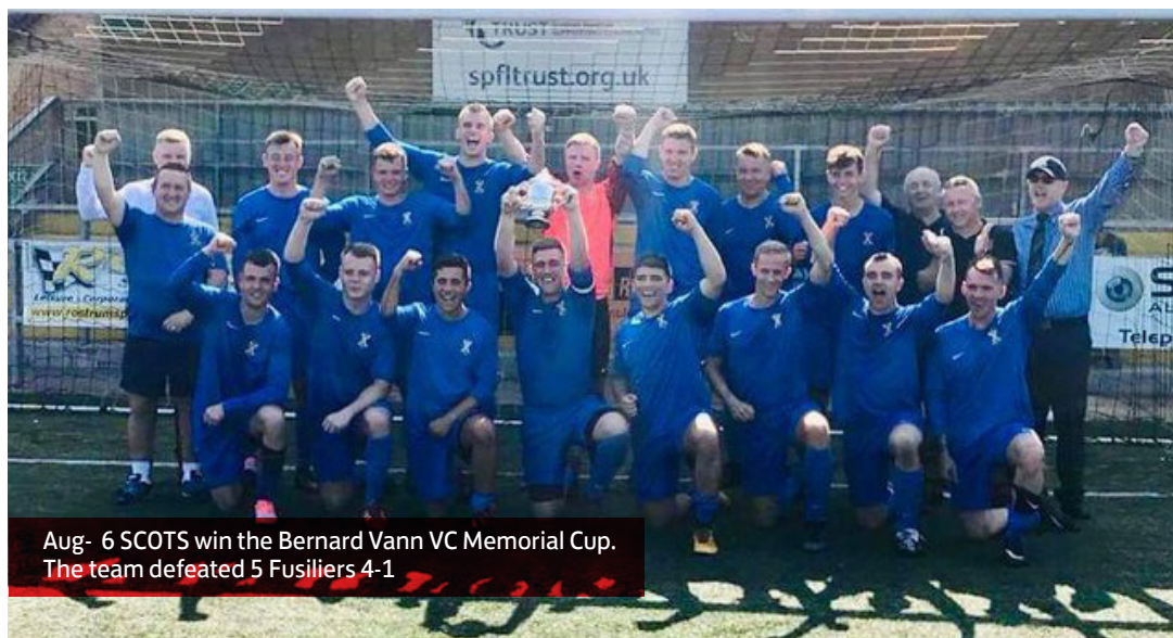
Aug- 6 SCOTS win the Bernard Vann VC Memorial Cup. The team defeated 5 Fusiliers 4-1