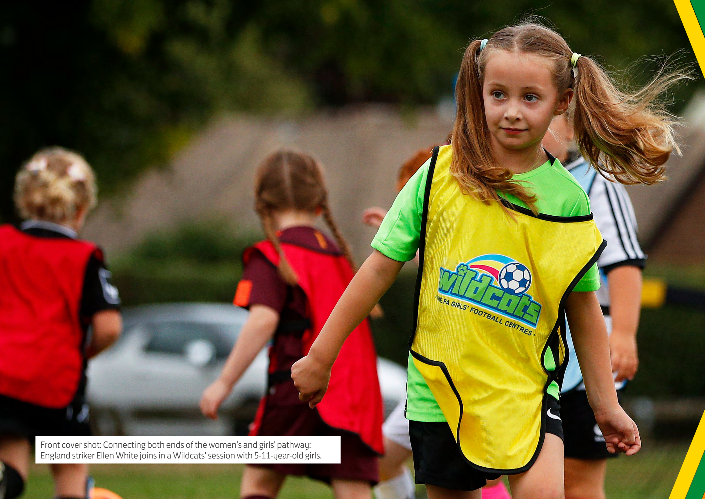
Front cover shot: Connecting both ends of the women's and girls' pathway: England striker Ellen White joins in a Wildcats' session with 5-11-year-old girls.