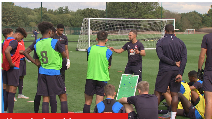
Normal colour vision