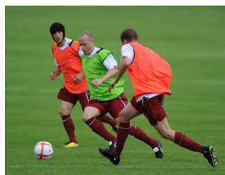
Normal colour vision