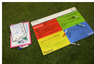
Normal colour vision

Statistically, one player in every male squad is colour blind 300+ million people worldwide are colour blind