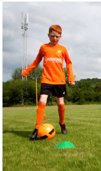
Normal colour vision