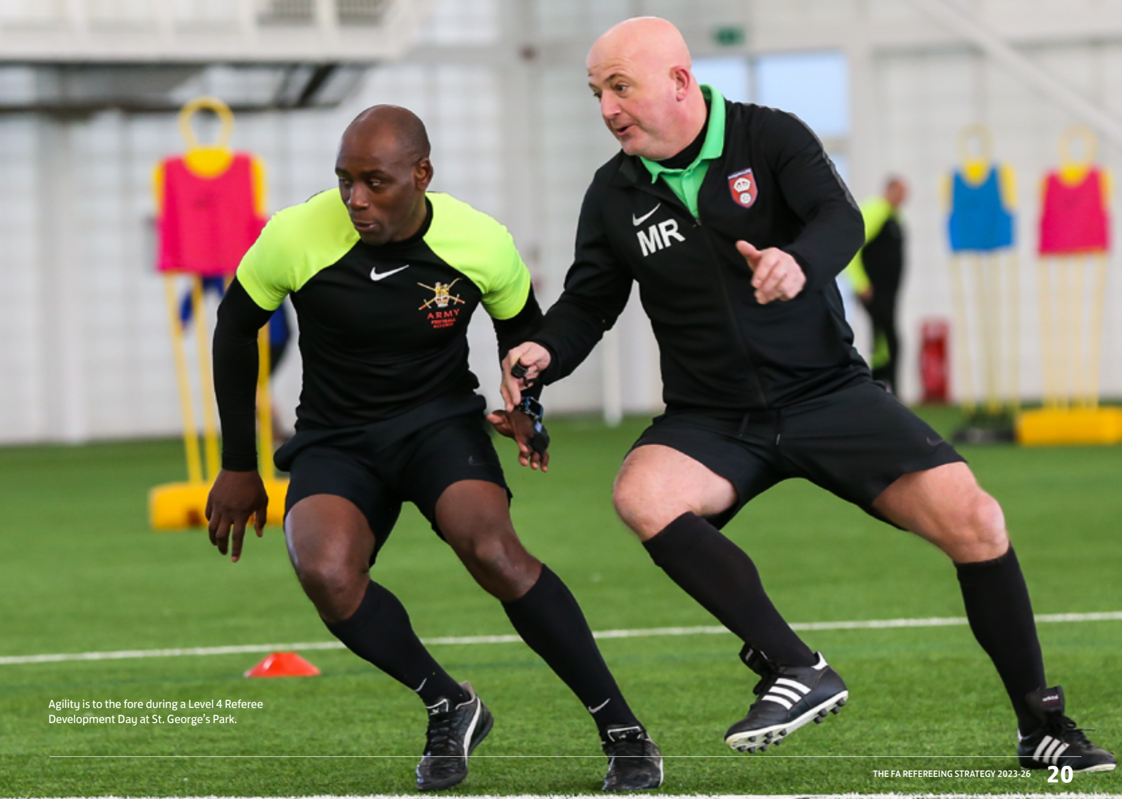
Agility is to the fore during a Level 4 Referee Development Day at St. George's Park.