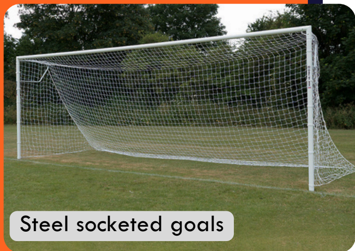
Steel socketed goals