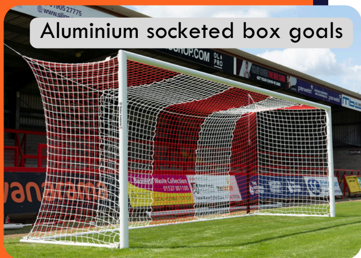
Aluminium socketed box goals