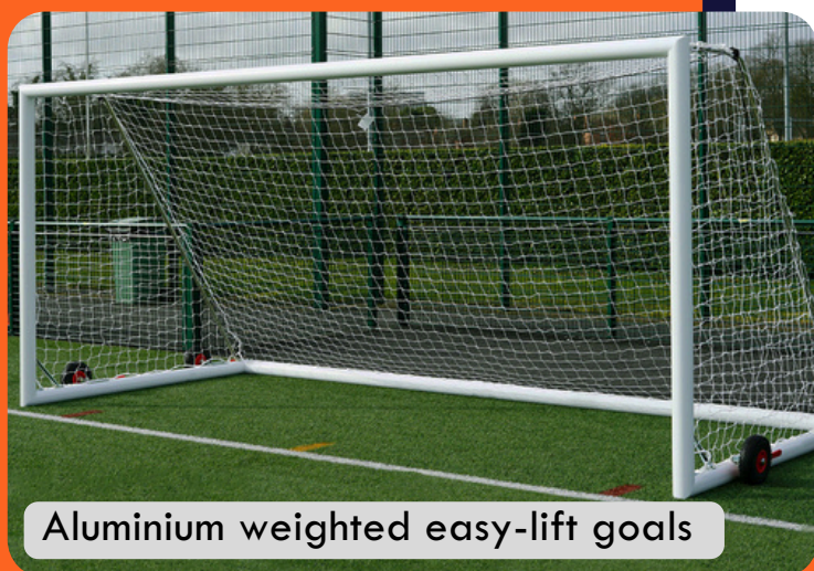
Aluminium weighted easy-lift goals

Our County FA discount is available on all of these goals and many more. Save up to 20%!