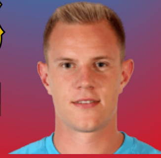
Marc Ter Stegen

TRY TO FINISH WITH THE BALL IN YOUR HANDS.