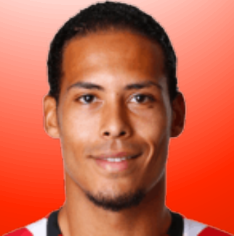
Virgil Van Dijk

TRY TO DRIVE INTO THE NEXT THIRD WITH THE BALL.