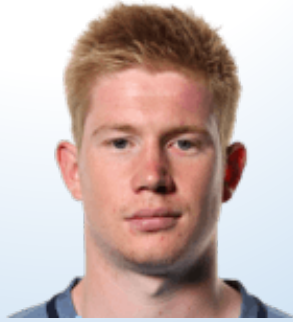
Kevin De Bruyne

TRY TO SET A TEAM MATE UP TO SHOOT WITH A THROUGH BALL.