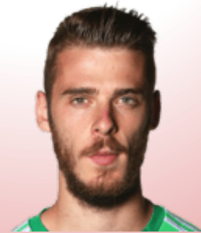
David De Gea

TRY TO RECEIVE FROM A TEAM MATE WHO IS UNDER PRESSURE.