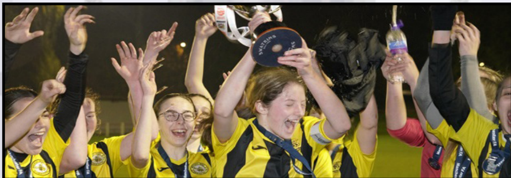
2023 Winners: Brendon Bees

These competitions offer both male and female players the opportunity to pit their skills against teams from across Greater Manchester, most of whom they wouldn't meet otherwise.