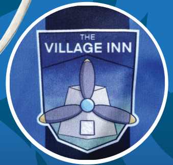
The Village Inn