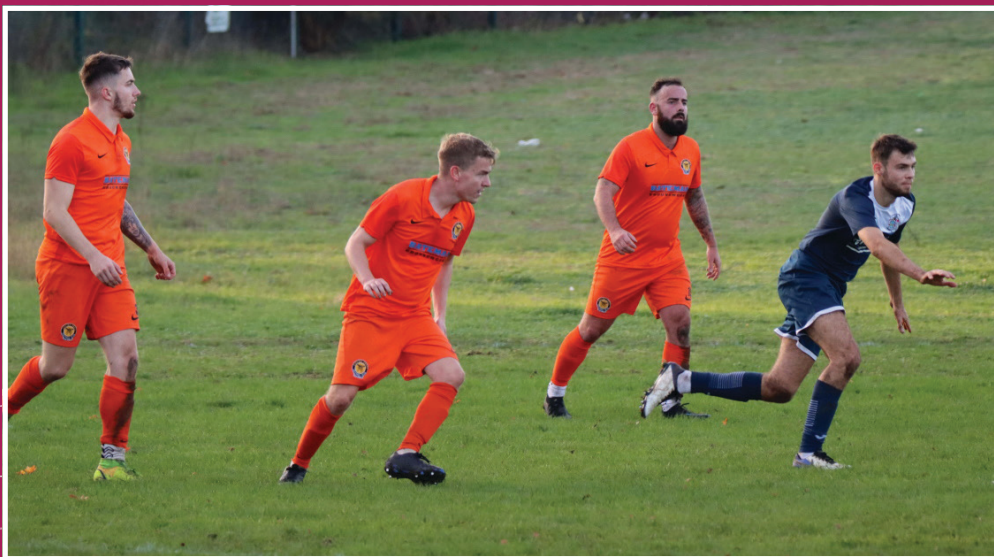
Gipping Gnats (orange shirts) are pictured in action against Hadleigh United Brettsiders (navy blue shirts) earlier this season.