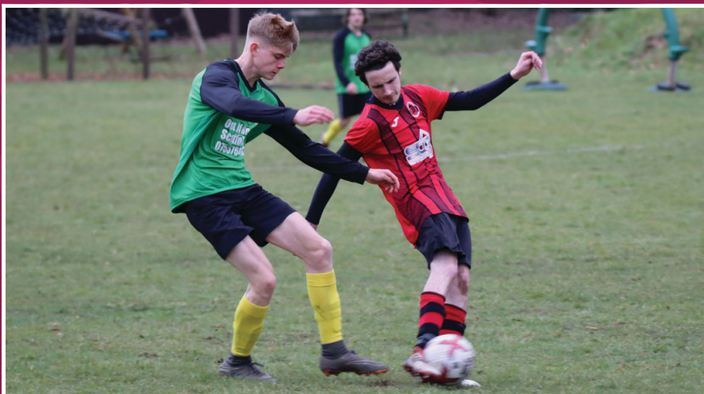
Coddensham Athletic (red & black striped shirts) pictured in action versus Laxfield (green shirts) during their 4-0 victory in the third round back in February.