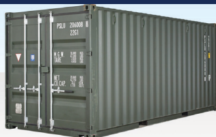
CONTAINERS FOR SALE