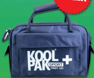
Team Sports First Aid Kit £27.76