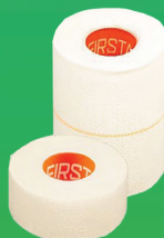
Elasticated Adhesive Bandage From £1.38