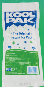
Original Ice Pack From 78p per pack