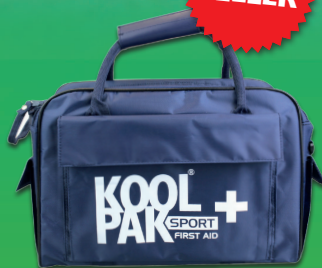
Team Sports First Aid Kit £27.76