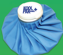
Ice Bag £3.94